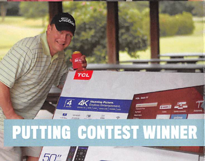
PUTTING CONTEST WINNER