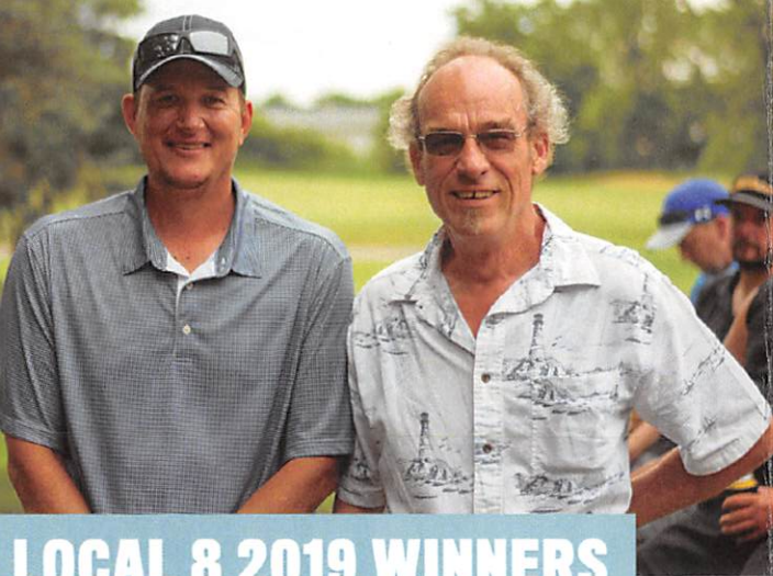
LOCAL 8 2019 WINNERS